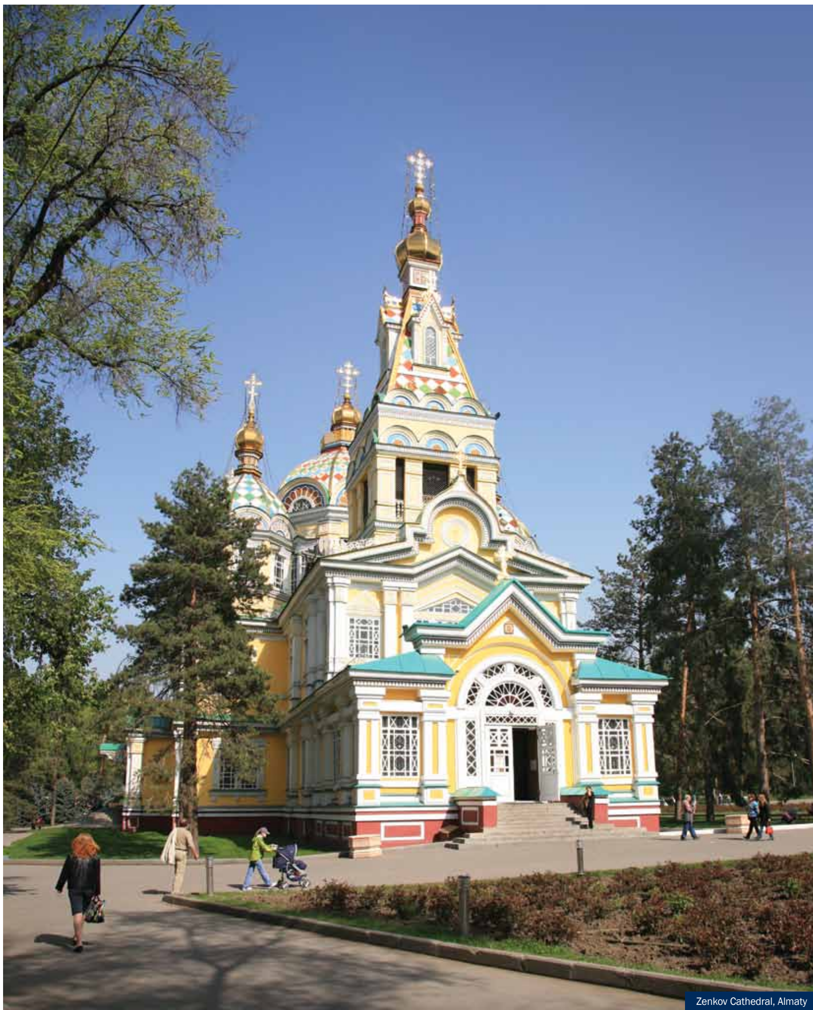
Zenkov Cathedral, Almaty