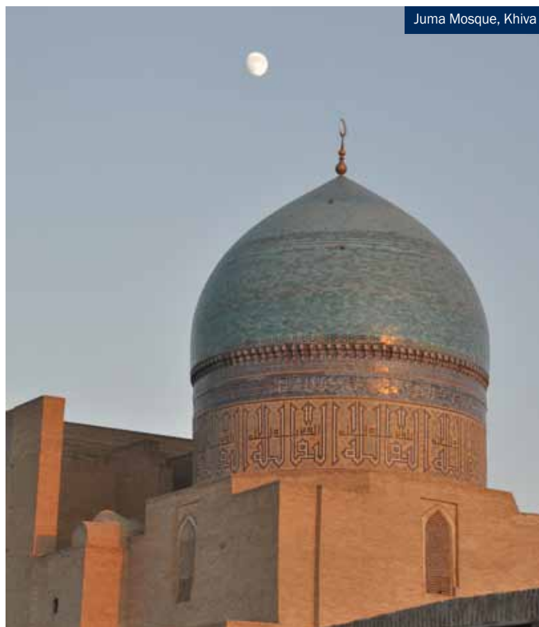
Juma Mosque, Khiva

Today we will visit some of its most significant sites including Registan Square, the refined elegance of the beautifully proportioned Bibi Khanum Mosque and the Ulug Beg observatory, one of the earliest Islamic astronomical observatories built in 1428. Before dinner we will return to the now illuminated and awe-inspiring Registan Square.