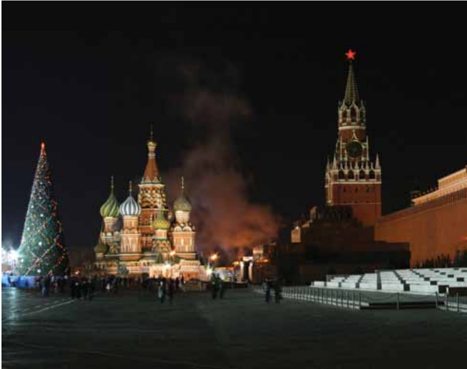
Red Square, Moscow

CHRISTMAS EVE IN MOSCOW AND NEW YEAR'S EVE IN ST PETERSBURG