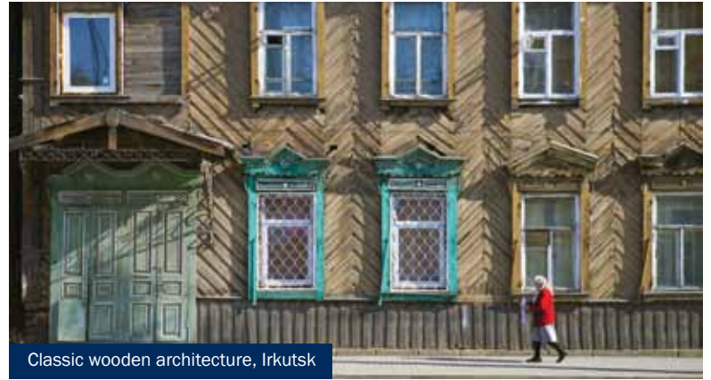
Classic wooden architecture, Irkutsk

A modern 'Soviet' city, we experience the life and character of Novosibirsk's rich culture where the arts and science predominate. The city is located in the heart of Russia and is situated on both banks of the River Ob. Our city tour takes us to Lenin Square where